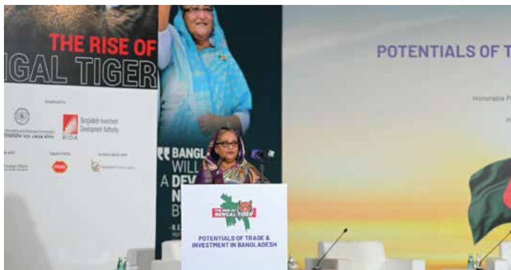
Hon'ble Prime Minister Sheikh Hasina, MP delivered her speech at Bangladesh Investment Summit 2023, Qatar

Hon'ble Prime Minister Sheikh Hasina, MP urged Qatar to invest in Bangladesh's energy sector, particularly in renewable energy, during her speech at the Doha Investment Summit 2023 on March 6, 2023 when she inaugurated the summit titled "The Rise of the Bengal Tiger: Potentials of Trade and Investment in Bangladesh" at the St. Regis Doha Hotel in Qatar. The event was organized by the Bangladesh Investment Development Authority (BIDA) and the Bangladesh Securities and Exchange Commission (BSEC) in partnership with the Ministry of Foreign Affairs, Bangladesh.