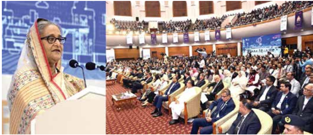
Hon'ble Prime Minister Sheikh Hasina, MP inaugurated the Bangladesh Business Summit, 2023

Hon'ble Prime Minister Sheikh Hasina, MP inaugurated the Bangladesh Business Summit, 2023 on March 11, 2023. Emphasizing the potential of Bangladesh in trade, business, and investment opportunities she said, "In the month of our independence, I call upon the global business leaders and investors to join us in our journey towards attaining a high-income developed and prosperous country by 2041 and build an innovation-driven Smart Bangladesh". She assured businesses that her government would extend all possible cooperation to overcome all existing challenges posed by the current global scenario.