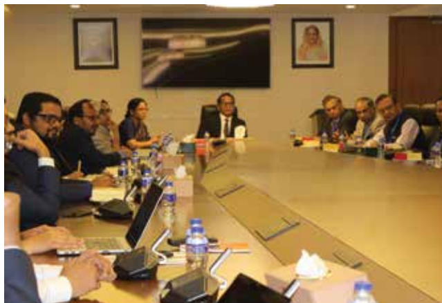
The leaders of the Bharat Chamber of Commerce (BCC) visited BIDA on March 22, 2023.

The leaders of the Bharat Chamber of Commerce (BCC) expressed interest in investing heavily in various sectors of Bangladesh meeting with the Bangladesh Investment Development Authority (BIDA) at the conference room of BIDA on March 22, 2023. A 10-member delegation of the BCC is recently four-day visit to Bangladesh to explore business opportunities.