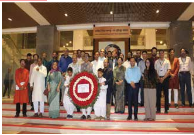
BIDA celebrates National Children's Day and the 103 rd birth anniversary of the Father of the Nation Bangabandhu Sheikh Mujibur Rahman

The theme for the event was "Bangabandhu's birthday in the dream of smart Bangladesh; children's eyes are colored with the dream of prosperity". A