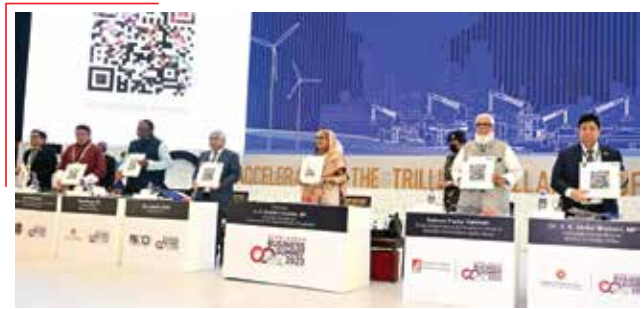
Hon'ble Prime Minister Sheikh Hasina, MP unveiled the Bangladesh Business Summit, 2023 souvenir during the Inaugural Ceremony

She further stated that if Bangladesh continues to grow at an average rate of over 5% per year, it has the potential to become a trillion-dollar economy by 2040. She highlighted the government's focus on private investment, including Foreign Direct Investment (FDI), as a prime strategy for achieving high growth rates. She mentioned that Bangladesh aims to increase the ratio of private investment to GDP to 31.43% by 2031, with a $350 billion infrastructure opportunity in the energy, water, logistics, and transport sectors, and a projected $90 billion logistics sector market by 2025.