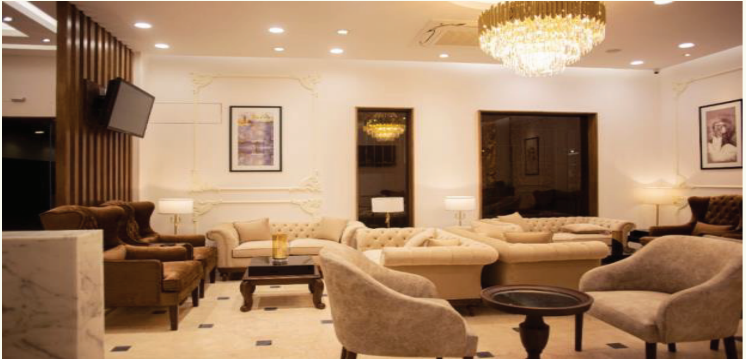
BIDA-funded lounge for investors at Dhaka's Hazrat Shahjajal International Airport.