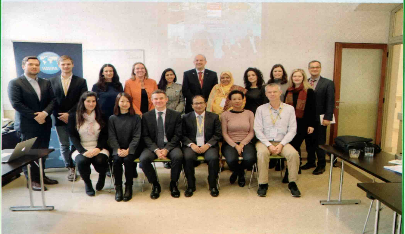
Participants of FDI Aftercare Training in Budapest (13-14 December 2018) Arranged by: World Association of Investment Promotion Agencies (WAIPA)