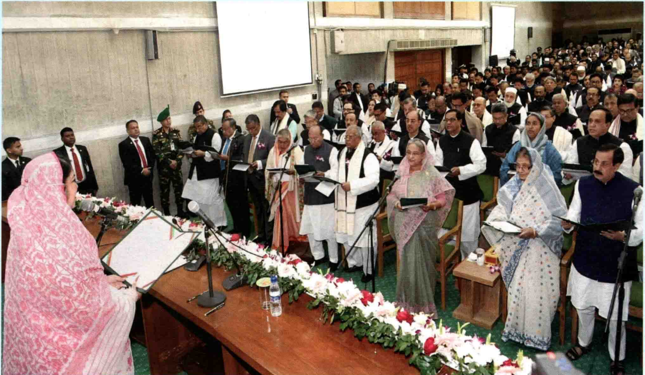
Prime Minister Sheikh Hasina with the newly elected Awami League MPs taking oath at the oath-room of Sangsad Bhaban on 3rd January administered by Speaker Dr. Shirin Sharmin Chowdhury

A Monthly Publication of Bangladesh Investment Development Authority (BIDA) January-February 2019 ■ Issue No. 02