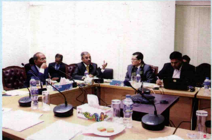
Stakeholders are stating their opinions at the preparatory meeting on Convention of Non Resident Bangladeshis at BIDA on 31st January

A preparatory meeting for arranging the Convention of Non Resident Bangladeshis (NRB) Engineers was held at BIDA. BIDA Executive Chairman presided over the meeting on 31st January at BIDA conference room with the stakeholders while NRB Engineers participated at the meeting from the USA through Skype. NRBs, on different occasions, have expressed their interests to utilize their efforts, knowledge, intellect and skills for the economic development of Bangladesh. With this end in view, and with the hope to see Bangladesh as the middle income country by 2021, NRB engineers are going to organize the CONE on 26-27 February in Bangladesh. NRB engineers from all over the world will participate in this convention which will be organized with the joint collaboration of Cabinet Division, ICT Division, BIDA, ERD, MoFA, A2I, USAID and UNDP among others. Three major components of the CONE are 1. NRB Engineers, 2. Government of Bangladesh and 3. Private Sector. 45-50 papers from 13 different countries are expected to be presented at the CONE.